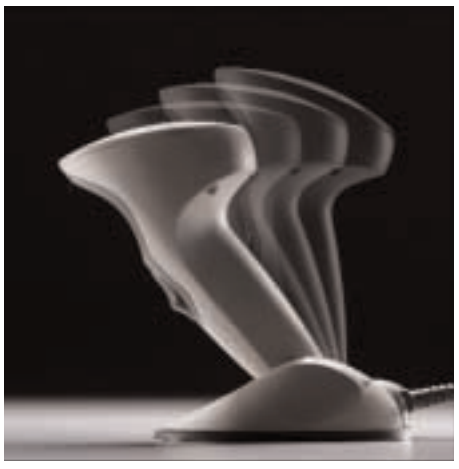
The adjustable built-in stand pivots to make scanning items easy-no matter how large or small.

A smart investment, Symbol's innovative new scanner is futureready now. The Cyclone scanner decodes existing, new and emerging bar code symbologies instantly. The Cyclone scanner is packed with features that deliver optimum flexibility including next generation scanning technology. As good looking as it is practical, the Cyclone's sleek design complements any store's decor. Large merchandise or small, single or multiple bar code types, this scanner can handle it all.