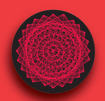
Cyclone's rotating omnidirectional scan pattern reads even truncated bar codes.