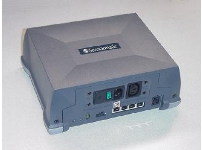
The compact ScanMax Pro Controller features table-top, vertical, and under-the-counter mounting options.