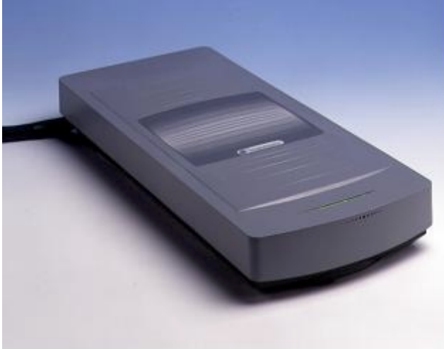
The PowerPad Pro is available as a table top, under-the-counter or end-of-the-counter deactivator.