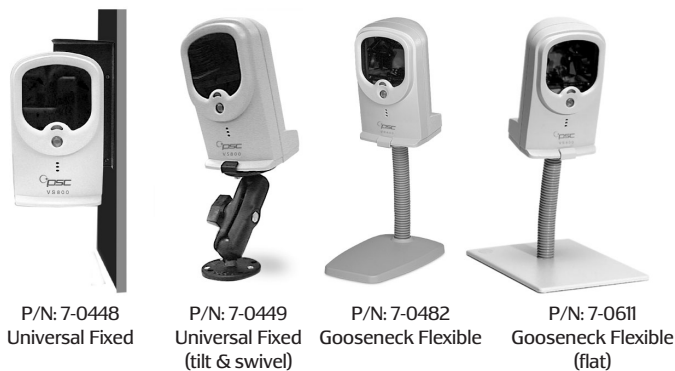
P/N: 7-0448 Universal Fixed