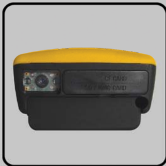
SCANNER, CF/SD CARD SLOT