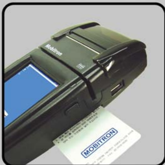
SMART CARD READER