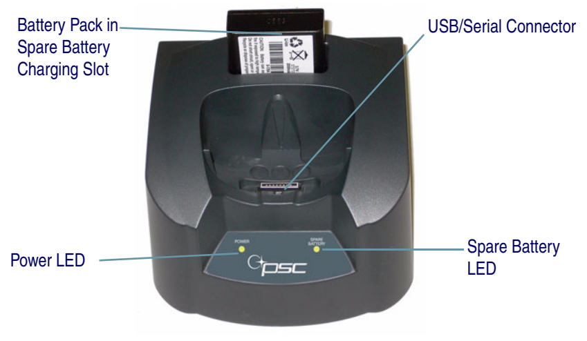
Figure 1. Single Slot Dock Contacts and LEDs

Communication. The Falcon communicates with the host PC using Microsoft ActiveSync protocol either via a USB port or via a serial port. Refer to the section on Communications in the Falcon 4410/4420 Product Reference Guide .