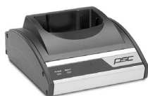
Falcon® Dock also available

959 Terry Street Eugene OR 97402-9150 USA Tel: 800 695 5700 or 541 683 5700 Fax: 541 345 7140