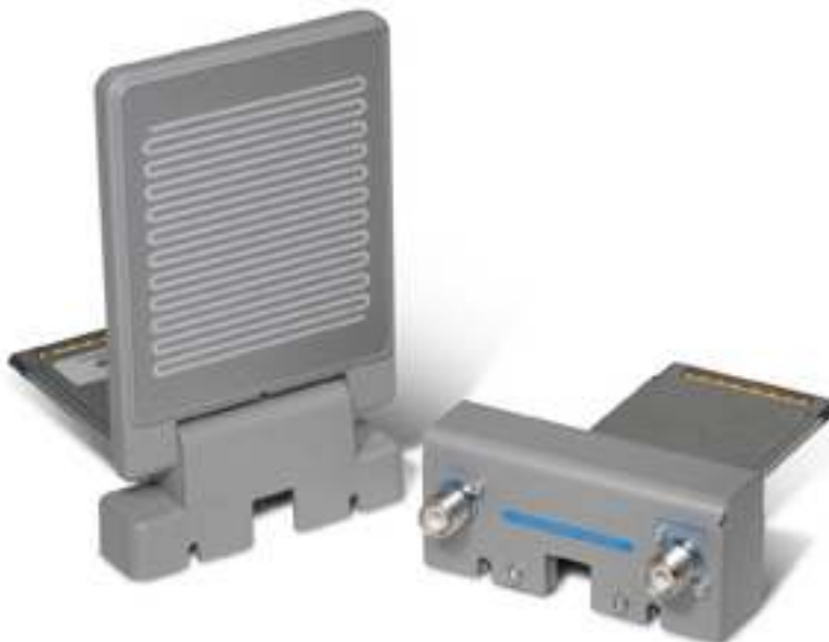
Figure 1. Cisco Aironet 1200 Series Access Points 802.11a Radio Modules

All available radios (802.11a, 802.11b, and 802.11g) provide a variety of transmit power settings to adjust coverage area size. To extend the flexibility of deployments, the 802.11a radio module is available in two versions (Figure 1). Both versions provide up to 12 nonoverlapping channels in the 5 GHz band (subject to local regulations); an additional 11 will become available in 2005 with a field firmware upgrade. One version offers dual antenna connectors for use with a wide variety of Cisco antennas to achieve extended range and application-specific coverage. The second has an integrated antenna design that incorporates diversity omnidirectional (5 dBi) and patch antennas (9 dBi). For ceiling, desktop, or other horizontal installations, the integrated omnidirectional antenna provides an optimal coverage pattern and maximum range. For wall-mount installations, the patch antenna provides a hemispherical coverage pattern that uniformly directs the radio energy from the wall and across the room. Both the omnidirectional and patch antennas provide diversity for maximum reliability, even in high-multipath environments such as offices and other indoor environments. Coupled with the broadest selection of 2.4 GHz and 5 GHz antennas in the industry, this provides users with unparalleled flexibility in cell size and coverage patterns.