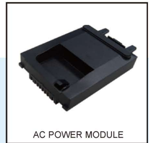
AC POWER MODULE