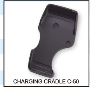
CHARGING CRADLE C-50

Character Sets Latin alphabet: 12 x 24, 16 x 32 Chinese characters: 24 x 24, 32 x 32 Japanese characters: 24 x 24, 32 x 32 Cyrillic characters: 12 x 24, 16 x 32 Scalable up to 8 times original size