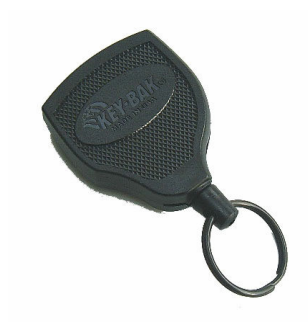
PPC1784 - Retractable belt clip

The retractable belt clip is an extremely high-quality key reel with 48" retractable pull. It features Stainless steel aircraft cable with nylon jacket for smoother draw. Unique ball-and-socket locking mechanism holds multiple keys. Heavy-duty polycarbonate case will not rust.