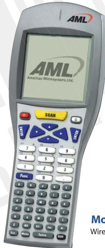
Model 7100 Wireless Hand-Held Terminal

AML is a leading developer & manufacturer of reliable, high-performance bar code and data collection products. Since 1983, AML and its partners have helped thousands of companies worldwide to increase business efficiency and productivity – in manufacturing, warehousing, retail, health care, finance, government, and education. AML products are made in the United States.