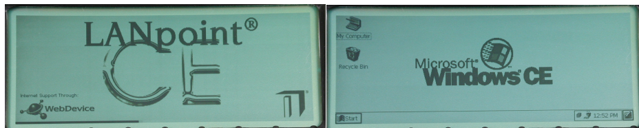
LANpoint CE splash screen