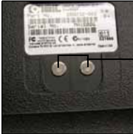
(2) Charging contact points

Note: The following information applies to printers installed with external charge capabilities.